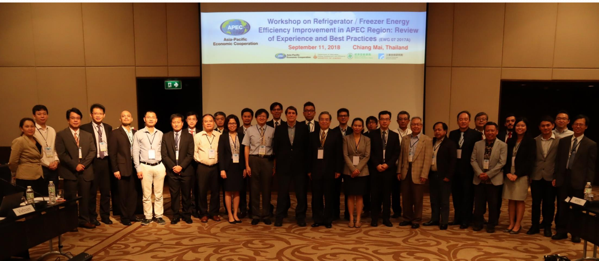
Group photo for the 2nd Workshop on Sep. 11, 2018 in Chiang Mai, Thailand.

Seven expert speakers and 45 attendants from 12 economies participated in this workshop