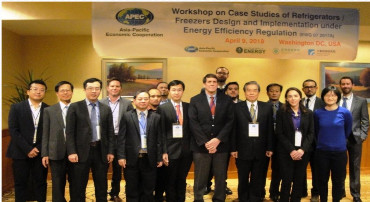
Group photo for the 1st Workshop on April 09, 2018 in Washington DC

Five expert speakers and 18 attendants from 10 economies participated in this workshop