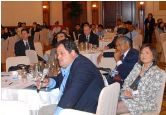
Active discussion and interest from the participants on the way forward for the APEC TRP.

Lynch commended APEC for developing the TRP, commenting that the risk-based approach provided a “value” definition to facilitate prioritization. Moving on to the third area of concern, Lynch addressed the impact of security measures. He opined that post incident measures could be classified under three broad approaches, i.e. shutdown of the port, severe restrictions such as 100% scanning or a measured response such as the APEC TRP. While not advocating one approach over another, Lynch stressed that all three approaches had differing risk conditions, considerations and impact and that regardless of approach, the key point for businesses to consider is how it wants to manage its risk with the insurance companies.