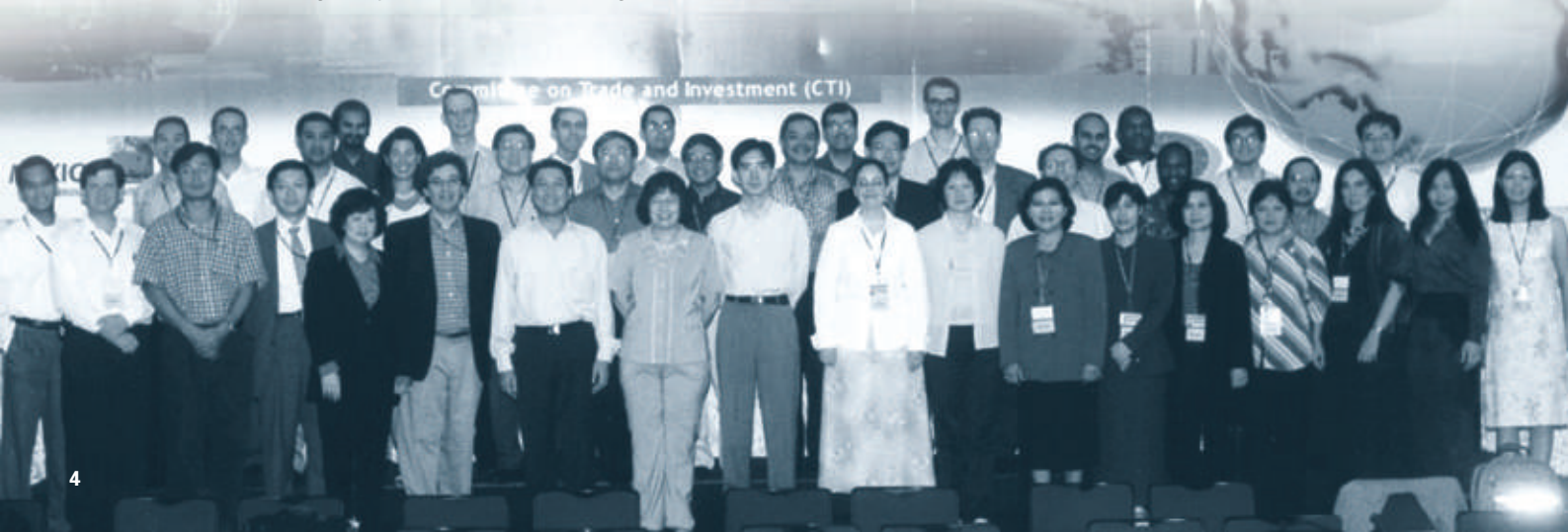
Third CTI Meeting, Acapulco, Mexico, 13-21 August 2002

CTI continued to utilize the informal exchange of views in the Trade Policy Dialogue (TPD) as a useful means of broadening perspectives and sharing approaches on issues. In this process, the TPD helps to contribute towards confidence-building among APEC members especially on new issue areas. The Committee conducted two half-day TPDs on business mobility and the "DDA Mandate on the Relationship between Trade and Investment". The latter is one of a series of TPDs on new WTO issues which are to be held to share information and build confidence amongst APEC members in the WTO DDA.