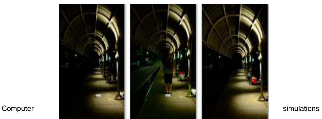
Figure 2.7 A Pilot study of adaptive lighting for covered walkway at KMUTT

LED adaptive lighting was among the key projects, thus a pilot study was carried out at KMUTT in order to develop a full proposal to the university and key partners. The study was looking into the potentials and users' subjective perception of applying LED adaptive lighting at KMUTT's main campus (see Figure 2.7). After the initial survey, the covered walkway around the main library was selected for the pilot study. The reason was that this type of covered walkway is quite common in Thailand where there need to be some forms of protection from sunlight and rain, thus the results can also be applied to wider applications. The objectives were to investigate the preferred high-levels and low-levels light setting for the adaptive lighting system under two background light levels.