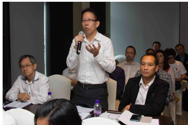
Figure 2.6 Exchanges on the Application of LEDs

economics of advanced LED technology and adaptive lighting approach.