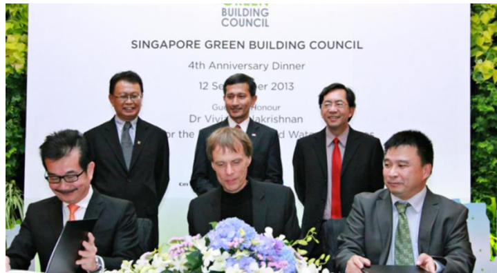
Figure 2.4 Singapore Lighting Technology Center to be launched (http://www.apec-lightingworkshop.org/news/)

Understanding (MOU) was signed on 12 September 2013, with the aim to develop a Lighting Technology Centre in Singapore over a two year period.