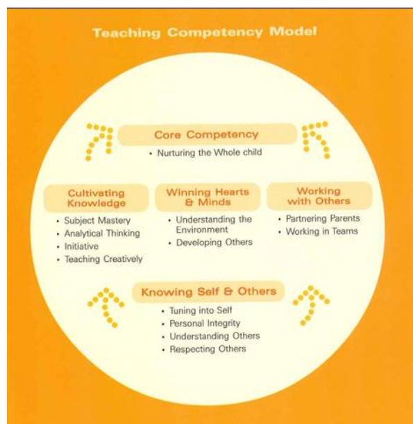
Fig 3: Teaching Competency Model

There is a set of 13 competencies in the Teaching Competency Model which teachers can use to identify their strengths and weaknesses as areas of continuous learning and professional growth (see Fig 3). Teachers are assessed on 9 of the 13 competencies – Nurturing the Whole Child and the competencies related to Cultivating Knowledge, Winning Hearts and Minds and Working with Others. The remaining 4 competencies related to ‘Knowing Self and Others’ are not used for assessment purposes but are considered as emotional intelligence competencies important for self development.