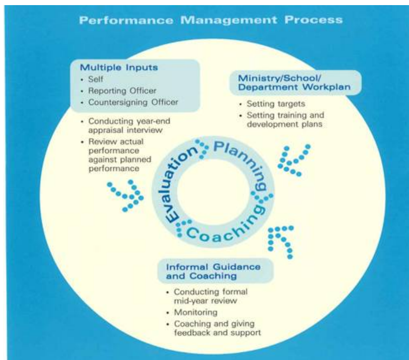
Fig. 2: Performance Management Process

Source: MOE, Enhanced Performance Management System – Teaching Fields of Excellence, p.7