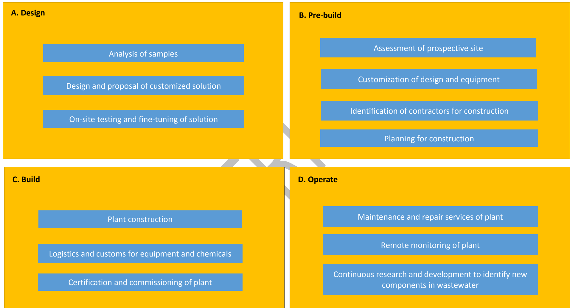
Figure 6.2. Dimension of the value chain covered by case study