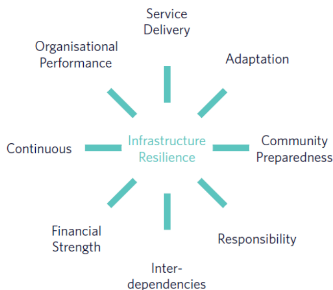
Figure 2: Resilience attributes

Incorporating resilience considerations into strategic thinking, planning and funding therefore requires a level of capability across central and local government in understanding resilience. Below we discuss two initiatives that have been undertaken in New Zealand, the Lifelines Council and incorporation of consideration of resilience into planning for transport infrastructure.